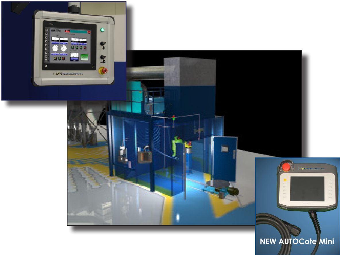
NEW AUTOCote Mini

Our Advanced Programming Technology (APT) team will work with your existing devices or replace them with modern robotics and industry standard automation equipment to create a unique AUTOCote system that meets your budget and production needs.