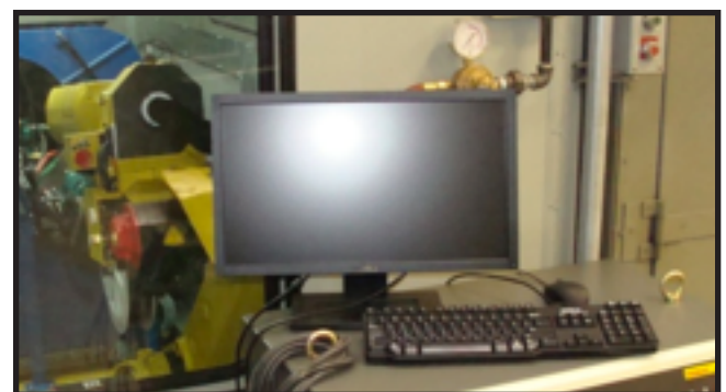
Example of Full Automation Upgrade to Existing Equipment (No Re-Qualification Required)